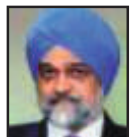
Dr. Montek Singh Ahluwalia Hon'ble Dy Chairman, NITI Ayog