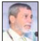
Sh. Siraj Hussain Secretary - MFPI Government of India