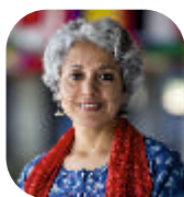
Dr. Soumya Swaminathan Chairperson, MS Swaminathan Research Foundation